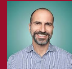
Dara Khosrowshahi, CEO, UBER