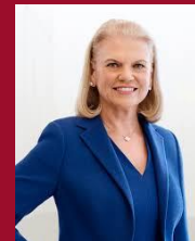
Ginni Rometty, Chairman, President and CEO, IBM