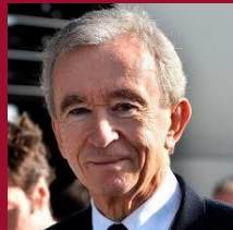
Bernard Arnault, Chairman & CEO, LVMH