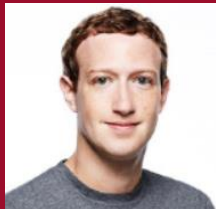
Mark Zuckerberg, Chief Executive Officer, FACEBOOK